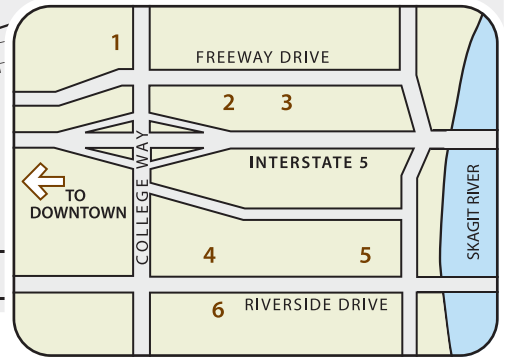
Hotels & Motels in Mount Vernon (1 mile North from Downtown)